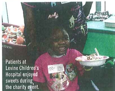
Patients at Levine Children's Hospital enjoyed sweets during the charity event.